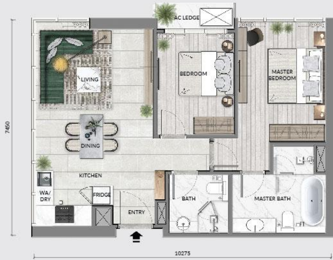
TYPE B 2 78 SQ.M. / 839 SQ.FT. TOWER 2