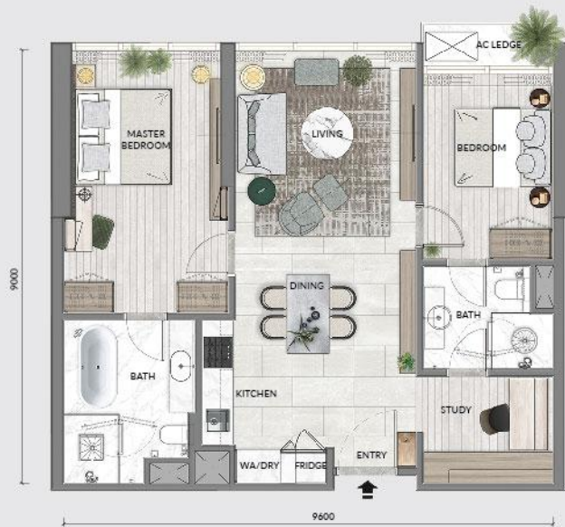
TYPE B 3 86 SQ.M. / 925 SQ.FT. TOWER 1