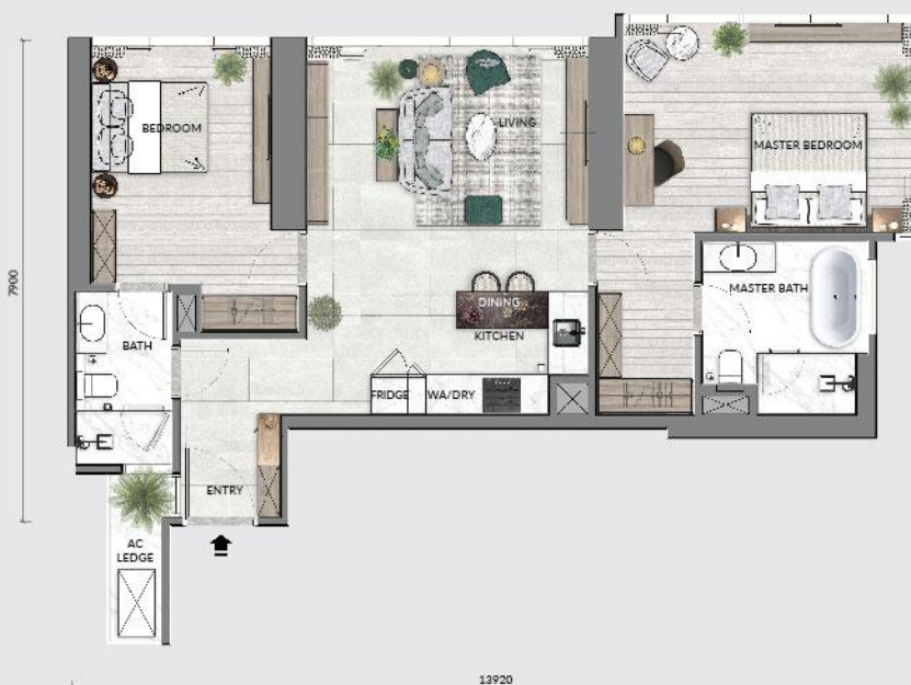
TYPE B 4 94 SQ.M. / 1,011 SQ.FT. TOWER 1